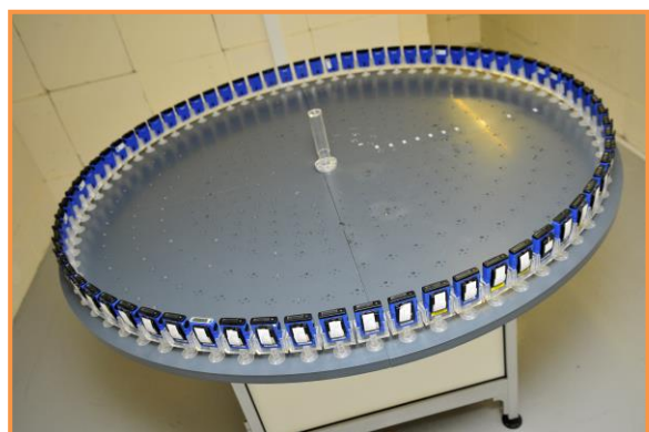
Radiological calibration facilities new EPD rig

The Radiological calibration facility continues to excel, in recent weeks the RCS facility has undergone a successful UKAS 17025 audit. An extension to scope now allows RCS to use their custom built EPD rig to calibrate up to 75 at any one time, this increased capacity will improve turnarounds significantly and will help drive higher revenues.