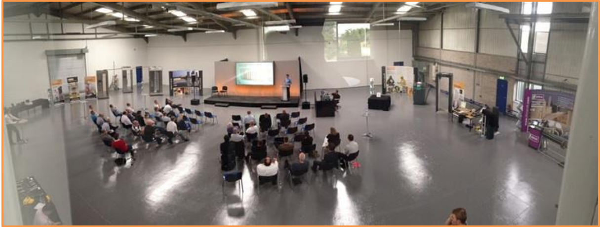
JFN Annual Instrumentation User Group Meeting 2013 at Deeside II

Deeside II's first introduction to many was the highly successful JFN Instrumentation User Group Meeting in which we showcased our NDT, Instrumentation (Rados & Mirion) and Radiological Calibration facilities for a number of high profile customers, such as EDF, MAGNOX, Urenco, and the Environment Agency.